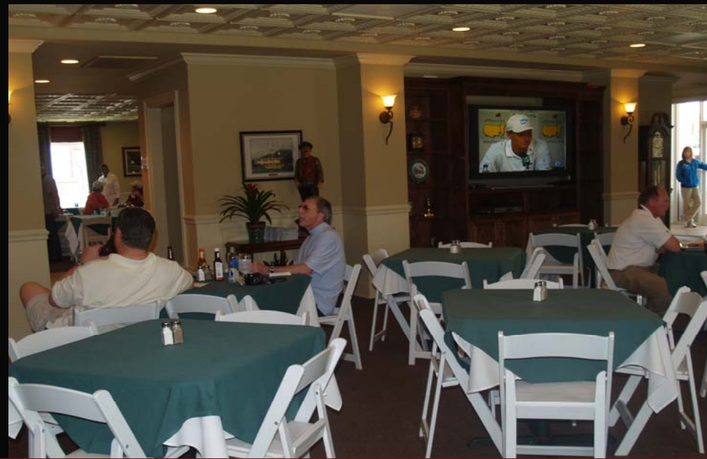
Interior & Dining Areas